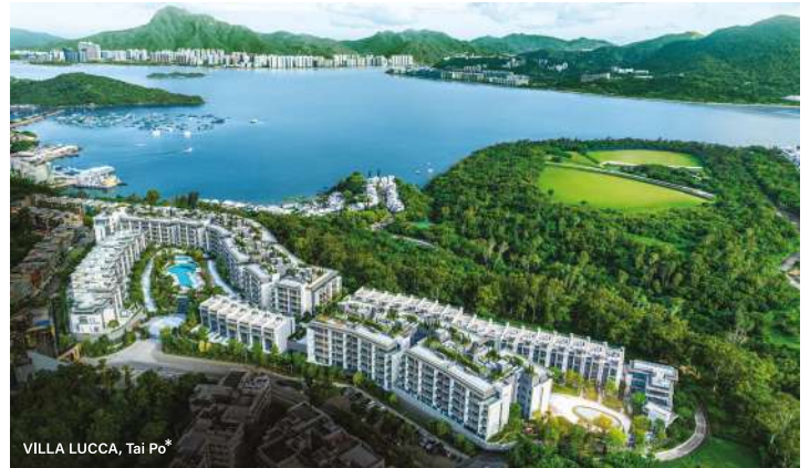
VILLA LUCCA, Tai Po*

*VILLA LUCCA: District: Tai Po | Name of Street at which the Development is situated and Street Number: 36 Lo Fai Road | The address of the website designated by the Vendor for the Development for the purposes of Part 2 of the Residential Properties (First-hand Sales) Ordinance: www.villalucca.com.hk | The photographs, images, drawings or sketches shown in this advertisement / promotional material represent an artist's impression of the development concerned only. They are not drawn to scale and/or may have been edited and processed with computerized imaging techniques. Prospective purchasers should make reference to the sales brochure for details of the development. The Vendor also advises prospective purchasers to conduct an on-site visit for a better understanding of the development site, its surrounding environment and the public facilities nearby.