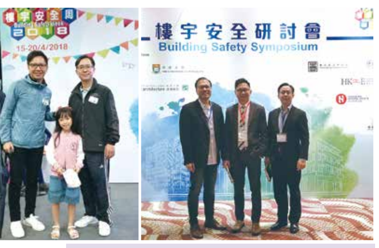
Building Safety Week 2018