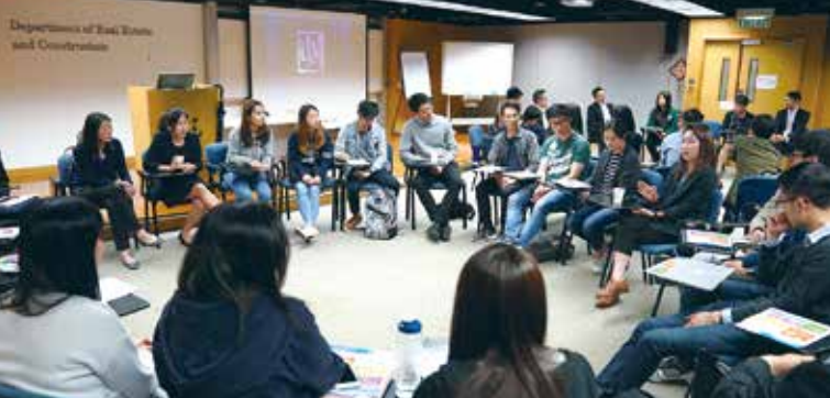
Career-Sharing Session at HKU

To boost participation by younger members at this event and their support for the division, the GPD will offer a discount to those members who have qualified since 2015, as well as probationers and students. The discounted quota is limited to 40 and will fill up on a first-come, first-served basis.