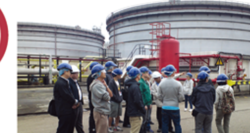
Past Technical Visits to Local Industries

Foundation Degree in Science in Fire Safety Engineering (FDSc) (2-year, Part-time mode)