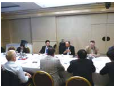
WAVO Board Members during the Meeting