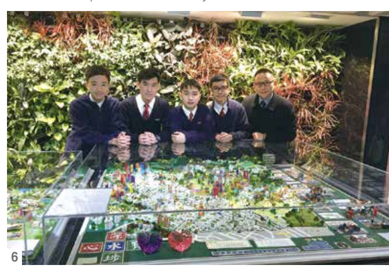
6. First-Place winners from Shun Tak Fraternal Association Leung Kau Kui College at the public exhibition

The article is published courtesy of Classified Post.