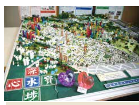
冠軍得獎作品 — 心水寶 (順德聯誼總會梁銶琚中學)