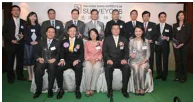
十大樓書大獎之得獎者合照