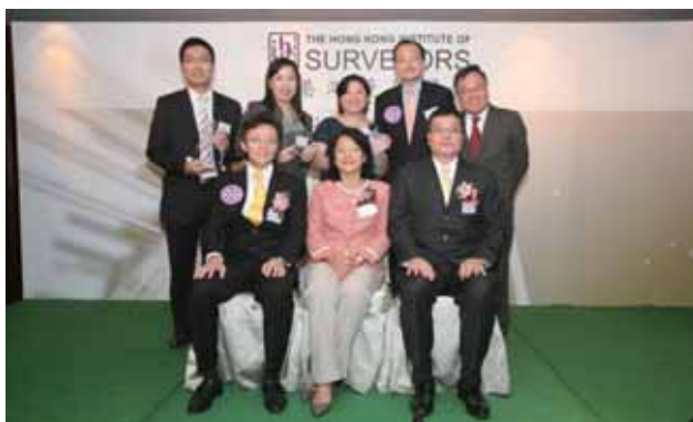
最佳環境表現大獎之得獎者合照