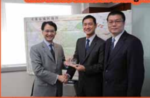
Visit to The Hong Kong Economic and Trade Office in Chengdu