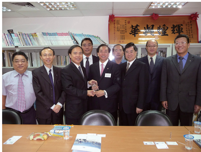
Presentation of souvenir to the President of Real Estate Appraisers Association

Apart from visiting high level government offices and agencies such as Ministry of Economic Affairs (經濟部), Mainland Affairs Committee (陸委會), Straits Exchange Foundation (海基會, HKIS representatives also visited the Real Estate Appraisers Association (不動產估價師公會). The Association requested HKIS to take the lead to develop deep collaboration between the two institutions and our Mainland and Macau counterparts such as organising regular conferences and professional visits.