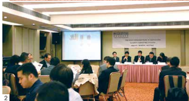
1. QSD Council 2016-2017 2. QSD Council AGM