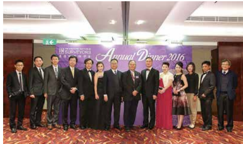
Guests of the Land Surveying Division include delegates from the RICS, CICES, HKIES, and LSGL of PolyU