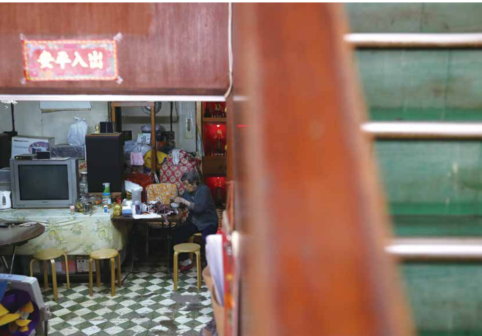
An old shop on Man On Street in Tai Kok Tsui, an area of intended redevelopment under URA plans.