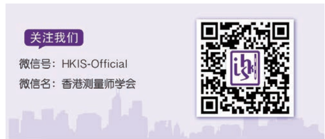
▲ 长按二维码，选择识别，直接关注

北京代表处：(86 10) 8219 1069 电子邮件：info-bjo@hkis.org.hk