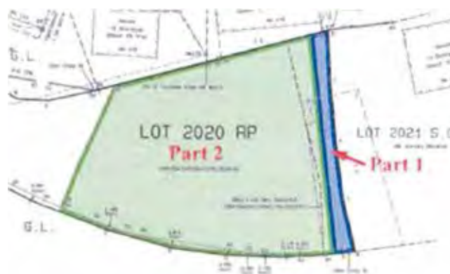
Reference : DCMP 1884/2012

The Adverse Possession sub-committee of the Law Reform Commission opined that adverse possession is a practical tool to solve land boundary problems in Hong Kong. Thus it is necessary to keep the status quo. As land surveyors, we should know, referring to the attached plan in an adverse possession judgment, that it is not the whole truth.