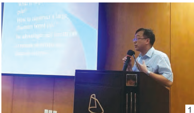
1 The 2nd CPD talk in Macau on 20 August 2015

In order to help members learn more about BIM, the BIM Sub-committee completed four BIM training courses over eight consecutive Saturdays during July and August. Over the past few months, four BIM CPD talks were also completed. Due to the overwhelming response, the BIM CPD talk entitled "Will BIM Replace QS" has been organised again for 25 November. Members who missed the first BIM CPD talk on 29 June are encouraged to register for this one as soon as possible.