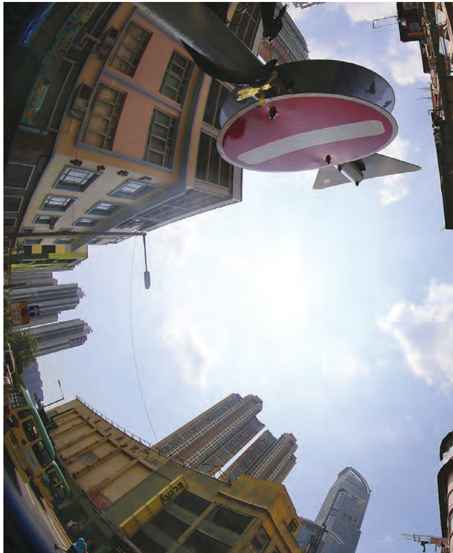
Aging apartment blocks stand side by side across parts of Kowloon