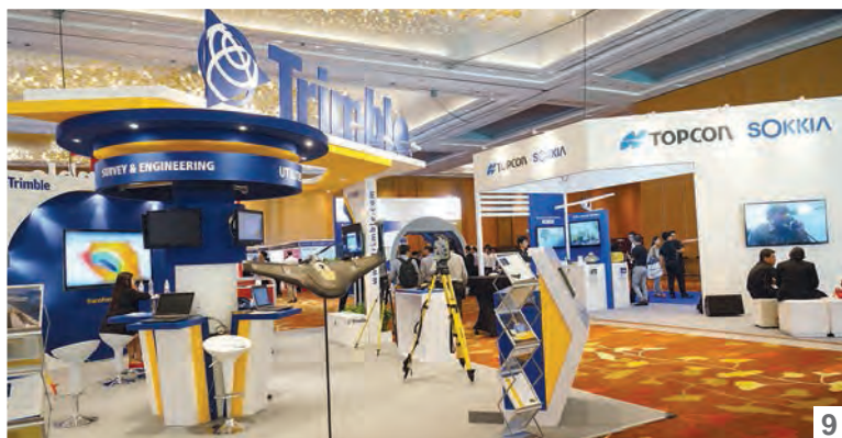
9 SEASC equipment and products exhibition