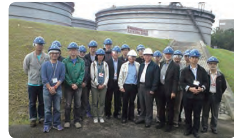
Technical visit to Tai Po Towngas