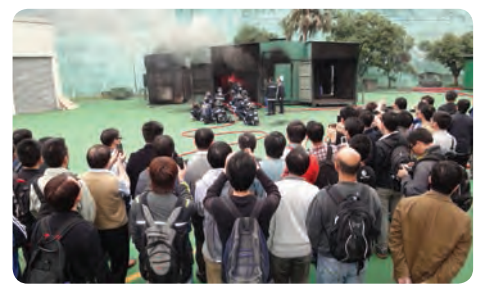
Visit to Fire Services Training School