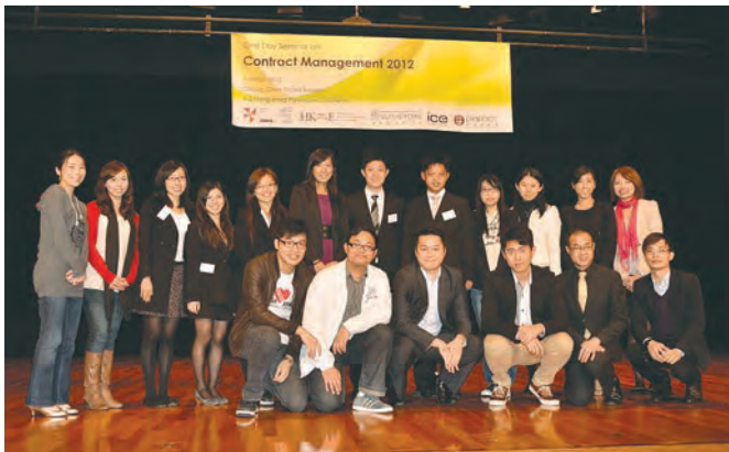
Special thanks to the hard work of the Organizations Committee and helpers from the 6 organizations

We had again a full house of participants filling up the Chiang Chen Studio Theatre of PolyU for this One Day Seminar held on 3 March 2012. I am honored to be the Chairman of the Joint-Institute Organizing Committee for this year’s seminar. I would like to thank our guest speakers for their valuable time and effort. I must not forget the contributions by all OC members and helpers from all 6 young professional groups to make this a successful event.