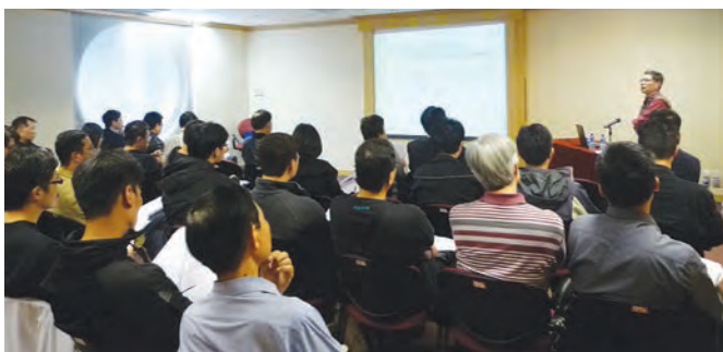
CPD event "Provisional List of Expert Witness on Water Seepage Disputes - Preparation of expert report?" held on 17 and 22 March 2012 respectively

We wish the course could be held regularly in the long run, and only those members who completed this structural learning course with the relevant qualification and experience will be eligible for application for inclusion in the full list of Expert Witness on Water Seepage Disputes. I find the series