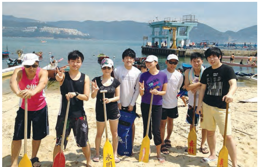
Time for playing game with the Sun! Welcome our new paddlers!

The flying dragons of HKIS are ready! Our legendary HKIS Dragon Boat Team has already started our series of intensive training every Sunday afternoon in order to prepare for the Championship. Want to be one of our paddlers, drummers, steersmen or cheer-leaders? Please drop us an email at ysg@hkis.org.hk .