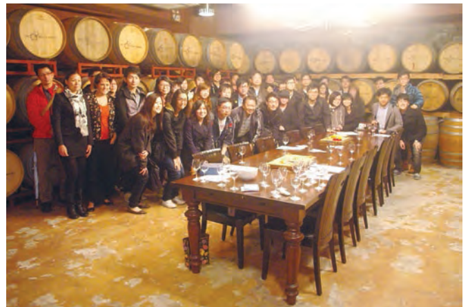
Look at the smiles on our faces, you can feel the taste of the local wine production

in a typical industrial building located in Ap Lei Chau. High quality fresh grapes originated from different continents are shipped to the factory, and then freshly pressed, aged in the oak barrels, and bottled there. We also tasted the “Made in Hong Kong” wine!