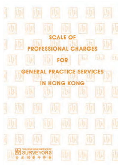
New Scale of Professional Charges was published on 1 July 2011