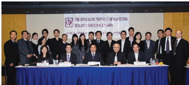
Group photo for new Council 2011-2012