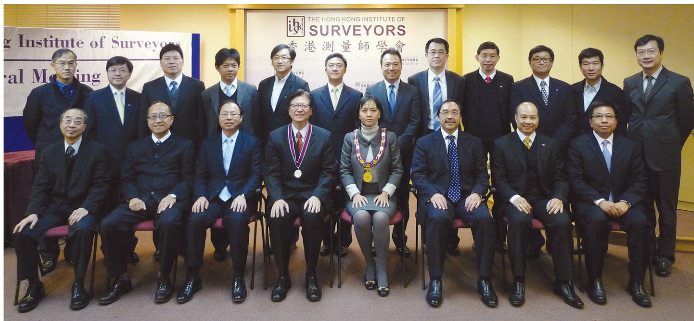
Members of General Council 2011-2012