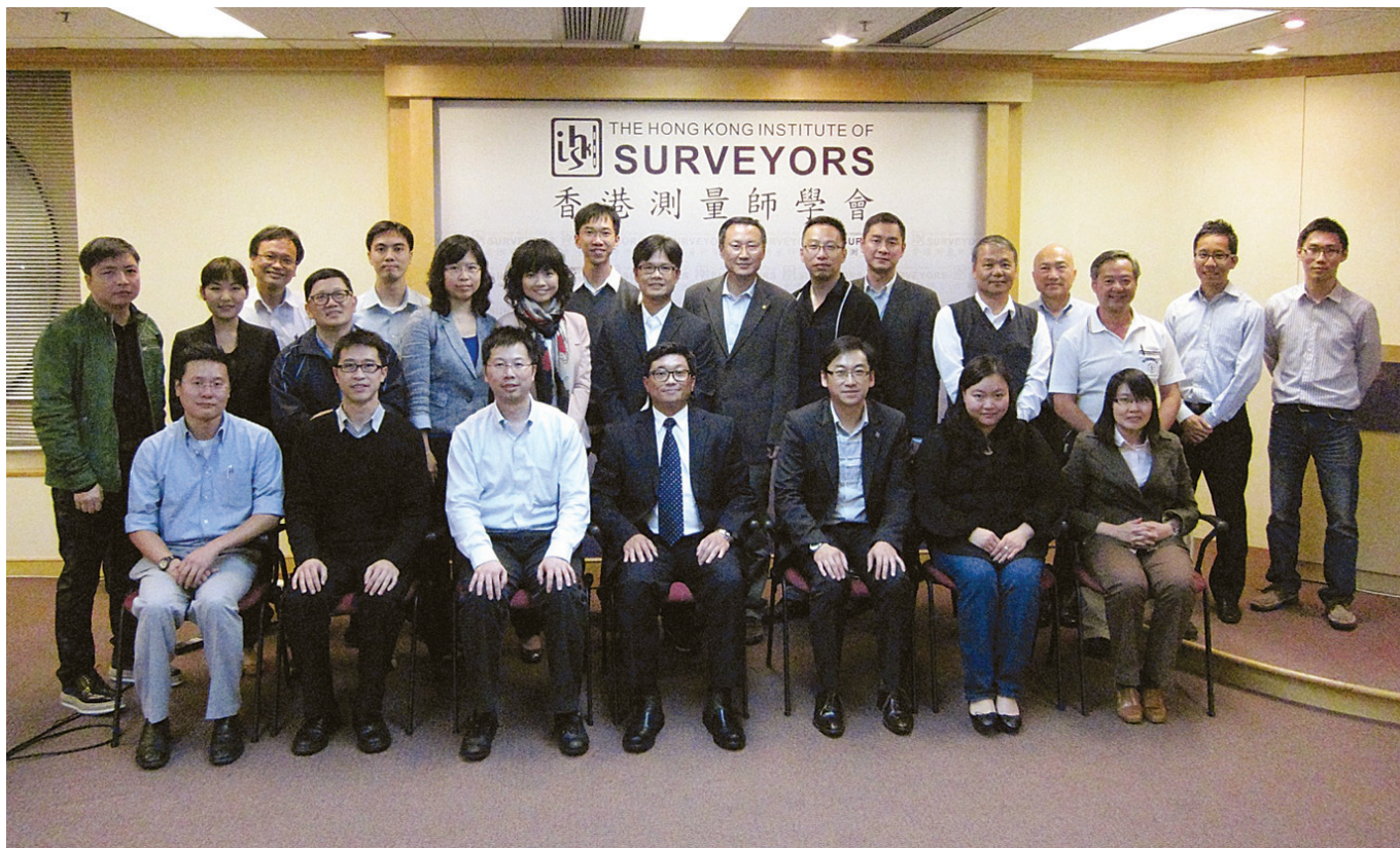
2011-2012 LSD Council members

For driving the development of spatial data infrastructure, we have organized the conference on Spatial Data Infrastructure in Hong Kong on 12 May 2011. This event had created a platform to foster collaboration in the industry.