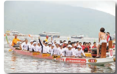
Join us and become a HKIS paddler!