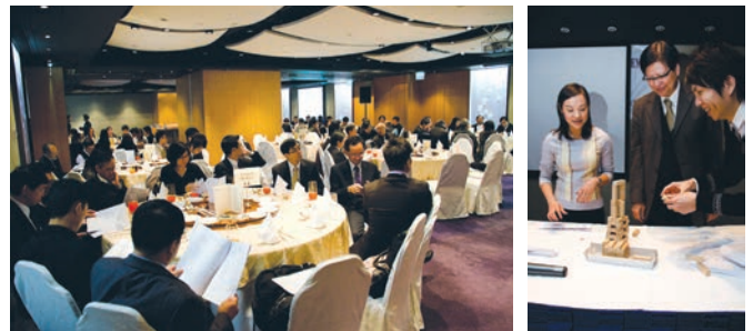
Happy moments on the Annual Dinner