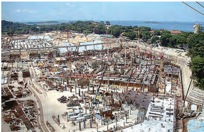
A view of the then work site of Sentosa