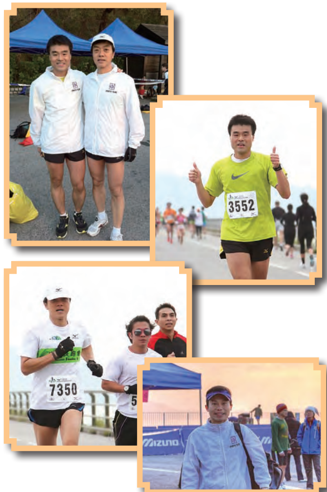
Mizuno Half-Marathon Open 2011

The Sports and Recreation Committee is recruiting members to join the “Support Team” in the Standard Chartered Marathon 2011. We targeted to station at Causeway Bay from 8:00 am to give our teammates the greatest support right before the beautiful finish. Please kindly register as a support teammate.