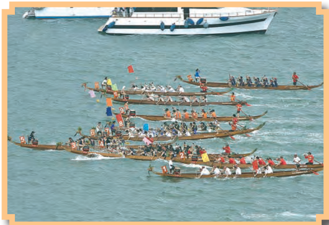
HKIS Dragonboat Team at Line 5