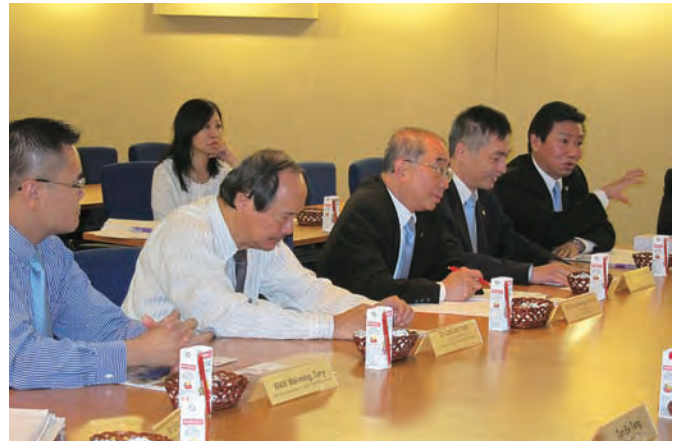
Meeting with Singapore HDB

After the meeting, HDB's representatives accompanied the delegates' tour around their Gallery. From different exhibits, we noted the rapid growth of public housing there and how new towns were comprehensively planned.