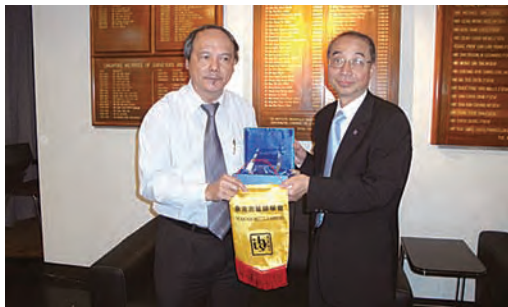
Presentation of souvenir to Singapore SISV

HKIS delegates exchanged views with the SISV on current professional development in the region and matters of common interests. It was agreed to have a closer relationship through regular meetings say on an annual basis so as to keep up with the latest market situation and professional development. In this regard, a Memorandum of Understanding was proposed. Agreement/comment on the draft MOU is being sought from the respective Councils before both institutes firm up the proposal. Apart from taking an active role in the WAVO, the GPD would also invite SISV delegates to visit the HKIS in April this year.