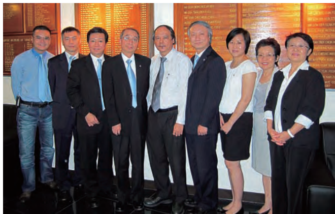
HKIS GPD Delegation Meeting with SISV