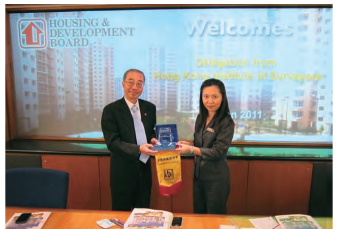
Presentation of souvenir to Singapore HDB