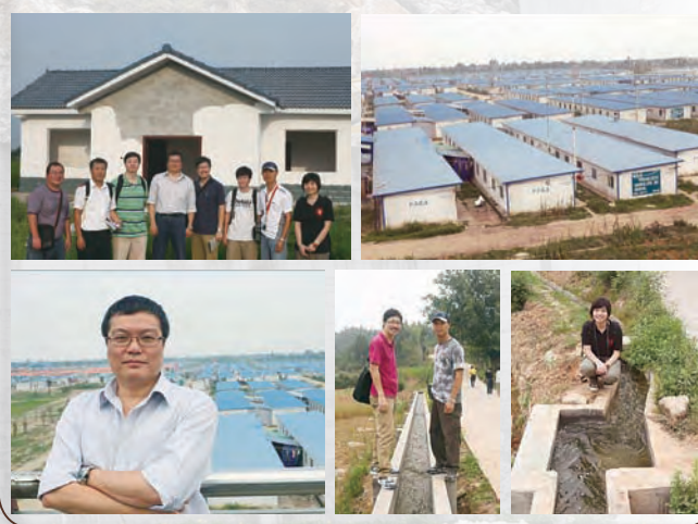
Photos of Working Group's Visit to Deyang (德陽)

During 22 to 24 June, a working group of the committee paid a visit to look at the Salvation Army's programmes to improve the medical facilities and irrigation water supply system which were seriously affected by the earthquake in Deyang (德陽市) of Sichuan. This programme included construction of 157 new medical clinics in Mianzhu (綿竹市), 72 in Luojiang County (羅江縣) and 68 in Shifeng (什邡市) respectively; upgrading the irrigation water supply system with a 2.7km long water channel and planting of several thousands of trees at Luojiang Xian (羅江縣).