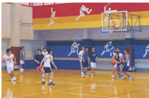
Take the rebound!