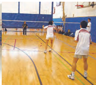
The best HKIS Badminton Doubles