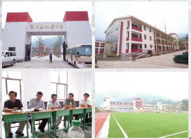
Photos of Inspection of Shui Mo Secondary School of Wenchuan County (汶川縣水磨中學), Sichuan Province