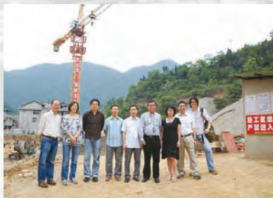
Photos of Reviewing the Reconstruction Projects in Tongku town