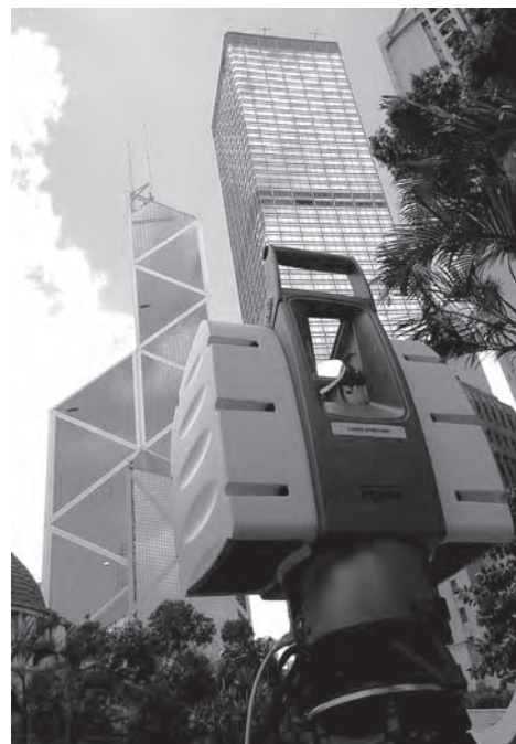
A good photo can speak!

The group leaders of the photography interest group would like to appeal for more interested members to join and share the beautiful photos and photographic knowledge. Tentatively, a few photo-taking sessions and trips are proposed. Models will be provided if required. In the future, group members will be invited to take photos in various important functions of the Institute.