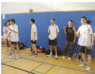
Full of confidence!