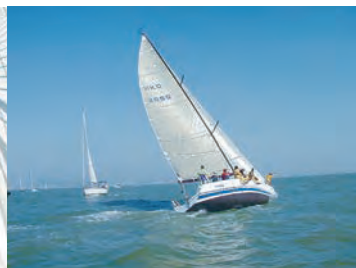
Take her to the sea, helmsman