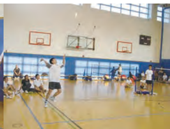
Jump and hit!