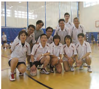
HKIS Badminton Team