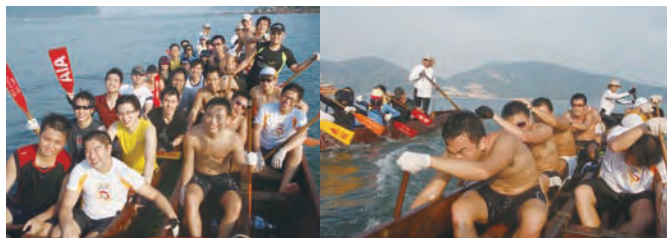
Law Soc Team and HKIS Team - Good friends at sea LawSoc Team practicing with HKIS Team - Synchronization

The HKIS Dragon Boat Team has prepared well to achieve another excellent result in the 60th National Day Celebration Dragon Boat Invitation Race on 4 October 2009 at Shau Kei Wan Typhoon Shelter. The team members underwent tough training for a whole month again. The photos below were taken during our practices with the dragon boat team of the Law Society of Hong Kong at each weekend.