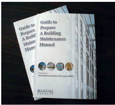
Guide to Prepare a Building Maintenance Manual