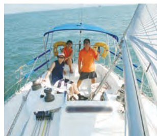
Surveyors in sailing

Don't worry if you have never tried. Please let us know if you are interested to join. Training will be provided. Please feel free to contact us for further details.