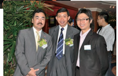
Thanks for the effort made by the Conference Organising Committee and the support of the HKIS President and the distinguished speakers