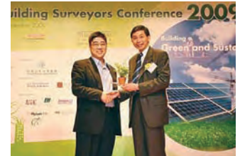
Souvenir presentations to our guests.