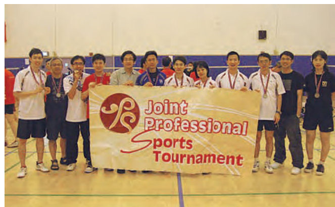
Presenting medals to the teammates

The Joint Professional Badminton Tournament was successfully held on 30 August 2009 (Sunday) at the Sports Hall of Shatin College. The HKIS Badminton Team made a significant advancement and got a much better result in the tournament this year with 7 teams from HKICPA, HKIA, HKBA, HKDA, HKMA, LawSoc and HKIS. As the Vice-chairman of the Joint Professional Sports Committee, I was proud to present medals to the HKIS badminton teammates as shown in the following photos.